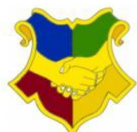
Southfields Primary School